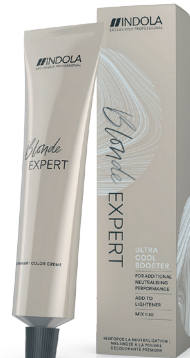
Profession Blonde Expert ULTRA COOL BOOSTER