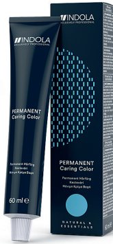
ProfessionPermanent Caring Color NATURAL & ESSENTIALS When smart colour meets perfection.