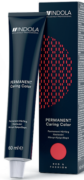
ProfessionPermanent Caring Color REDS & FASHION Highlights to turn heads.