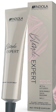
Profession Blonde Expert HIGHLIGHT 100+ BLEND