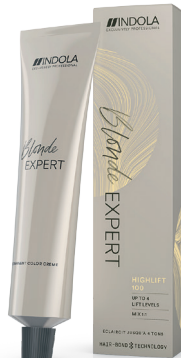
Profession Blonde Expert HIGHLIGHT 100 BLEND