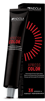
ProfessionPermanent Caring Color XPRESS COLOUR 3x faster and perfect performance.